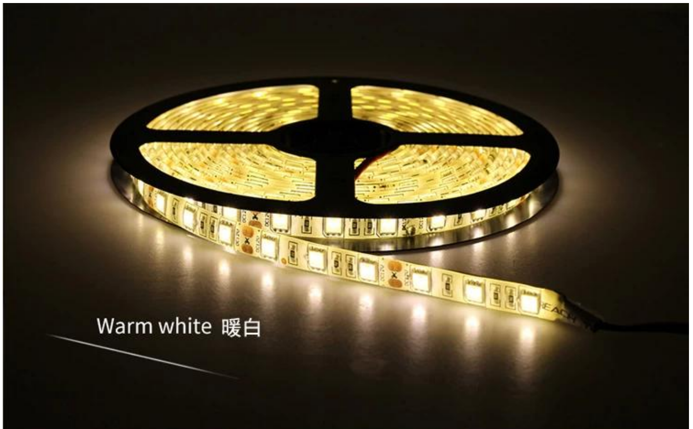
Warm white 暖白