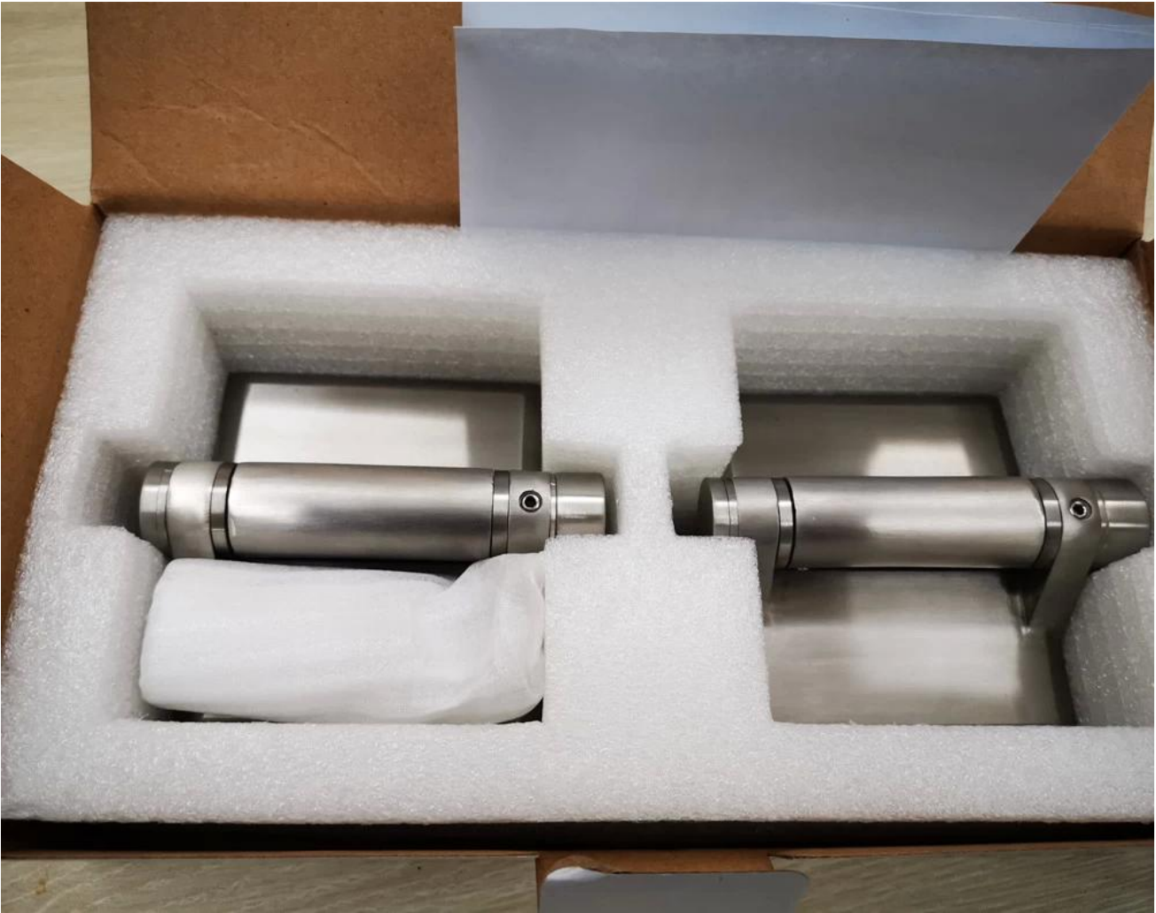
Glass to glass post hinge, with flat cap on the ends, in black powder coating