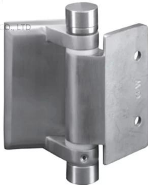
Glass to round post hinge-