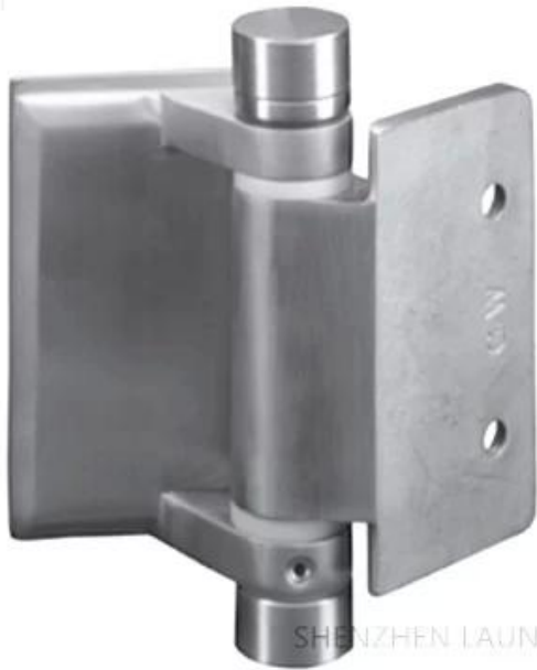
Glass to wall hinge-