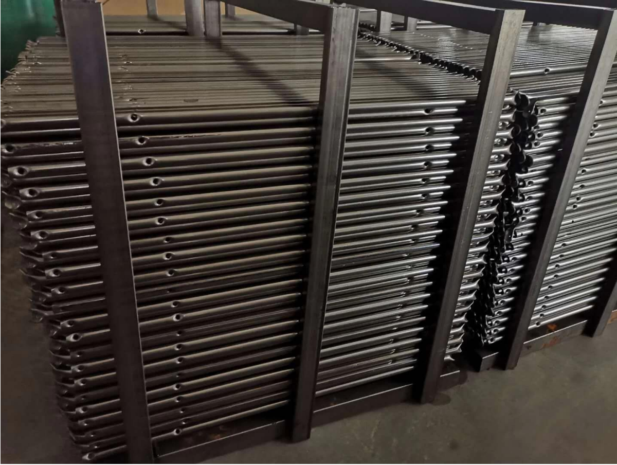
Packing of pictures