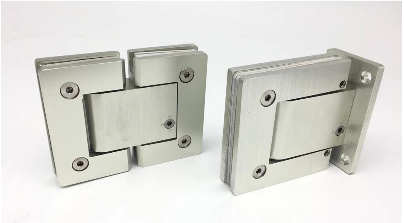
90 Degree Glass Shower Hinge in Stainless Steel & Aluminum Material: